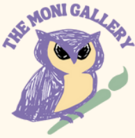
PHOTO & VIDEO